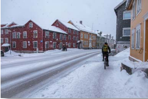
A Snowy Day in Tromsø, Norway.jpg