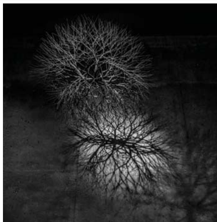
Ruth Asawa tied wire sculpture.jpg

A sublime landscape, beautiful scene, fragile and fleeting. I can feel the end of autumn and the approach of winter. Well done.