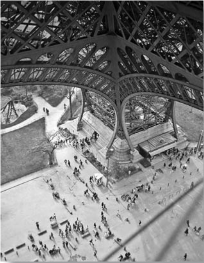
Inside the Eiffel Tower, Paris.jpg

I totally appreciate this image after my years of living in Sweden and traveling by bike in the winter. Thanks for bringing me back 20+ years to those frigid rides!