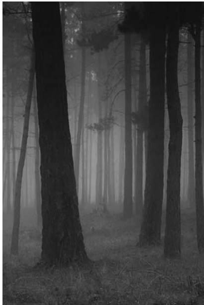
Monterey Pine`s ( Pinus radiata )Surrounded In Fog, Pebble Beach.jpg

I like how the photographer isolated this lone tree on the mountainside of white snow. I'm waiting for the avalanche. I also appreciate the monochromatic colors of winter with the blues and greys, reinforcing the barren hillside and the cold season.