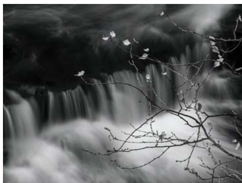
Fall Is In The Air.jpg